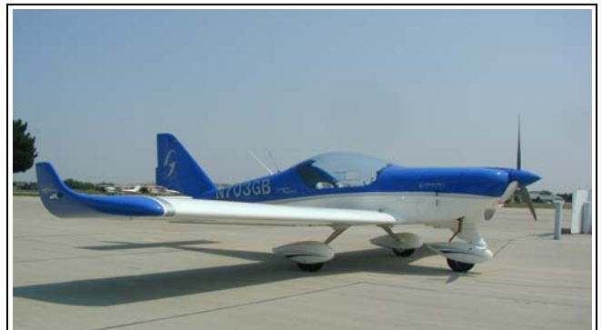
Skyraider Aviation's new addition... the Gobosh G700S

The G-700 is imported from Poland by Gobosh Aviation, Inc