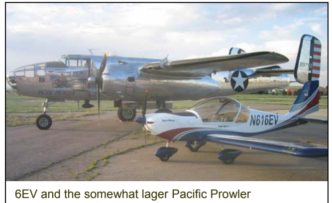
6EV and the somewhat larger Pacific Prowler

... and on June 20 th , our Evektor SportStar was in great company indeed! The Erie Municipal Airport was graced by a visit from the North American B-25, Pacific Prowler . The Pacific Prowler is one of only a handful of B-25's that still fly today. The B-25 Mitchell Bomber was made famous by the daring Doolittle Raid on Tokyo which took place four months after the Japanese bombed Pearl Harbor. The B-25 went on to become the most versatile medium bomber of World War II, seeing combat in every theater of operation. The Pacific Prowler flew over 120 missions during the war.